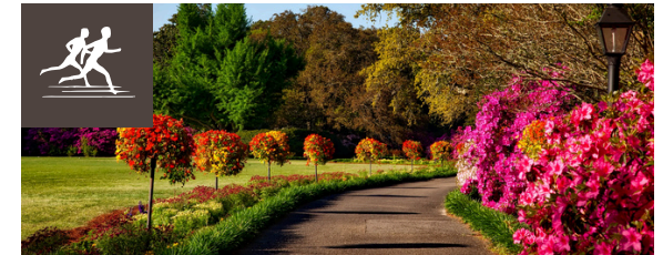
Jogging paths and open garden