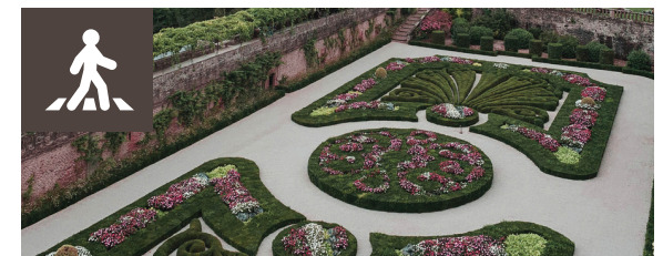
Wide, walkable pedestrian lanes