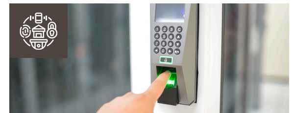
One-gate security system