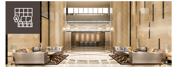
Co-working lounge and multipurpose hall